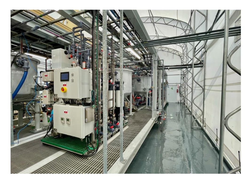
Figure 2. SiFT pilot plant installed and integrated with the existing DLE plant inside the weatherproof structure in El Dorado, Arkansas.